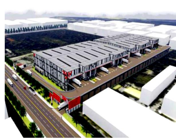
Investment & Real Estate