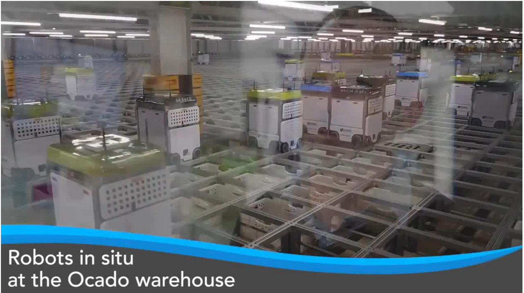
Robots in situ at the Ocado warehouse