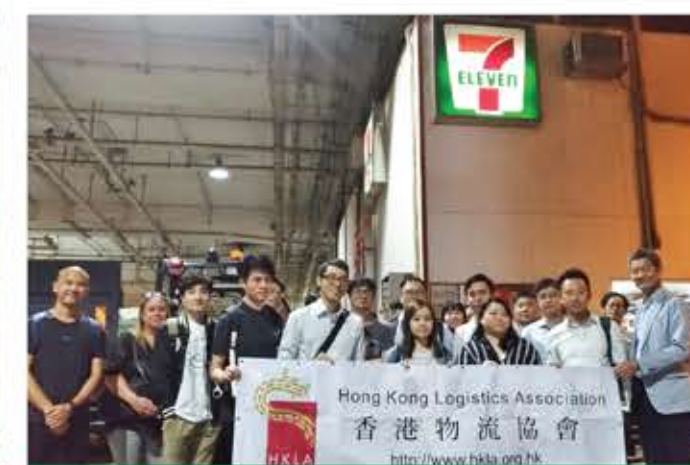
Visit to 7-Eleven Distribution Centre on 16 May 2018