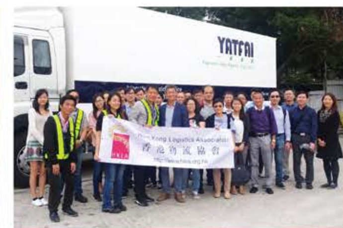
Visit to Yat Fai Warehouse on 6 May 2018