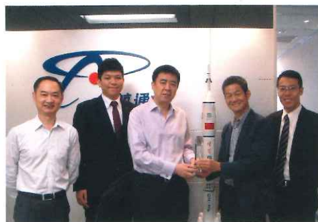
Castel Hong Kong Limited