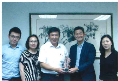
Timax Logistics Company Limited