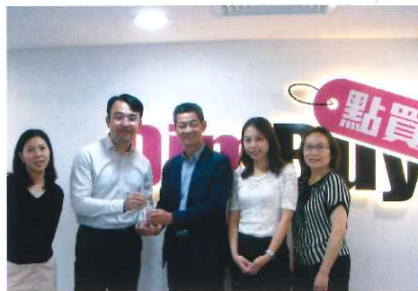
Dimbuy.com Company Limited