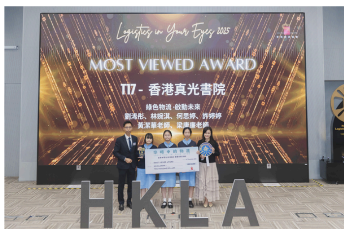
最受歡迎獎及最高觀看率獎： T17 《綠色物流・啟動未來》 - 香港真光書院