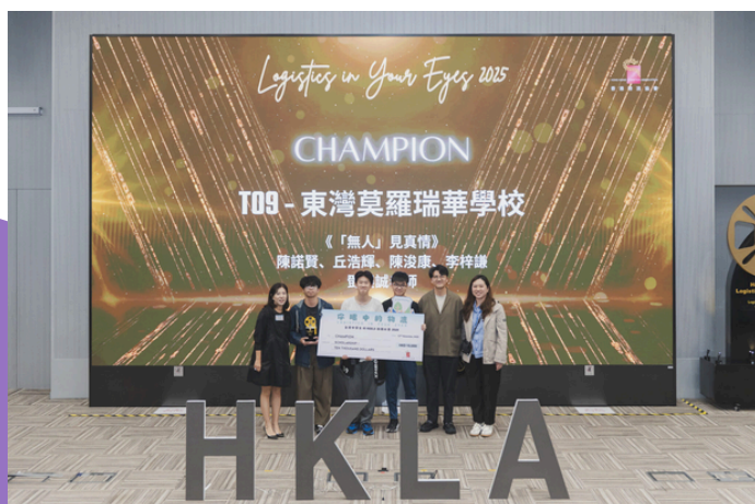
冠軍：T09 《「無人」見真情》 - 東灣莫羅瑞華學校