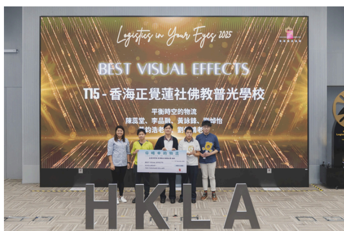
最佳效果獎：T15 《平衡時空的物流》 - 香海正覺蓮社佛教普光學校