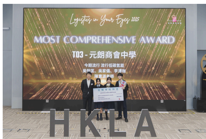
全面綜合獎：T03 《今期流行 流行低碳氫能》 - 元朗商會中學