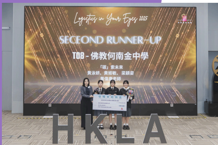
季軍：T08 《「碳」索未來》 - 佛教何南金中學