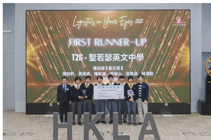
亞軍：T26 《懂低碳 $ 贏百萬 $》 - 聖若瑟英文中學