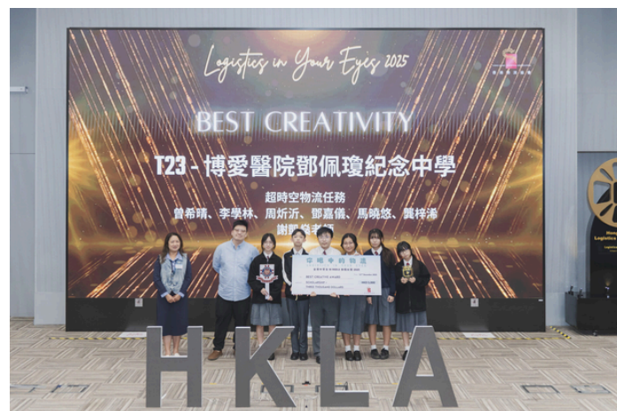
最具創意獎：T23 《超時空物流任務》 - 博愛醫院 鄧佩瓊紀念中學