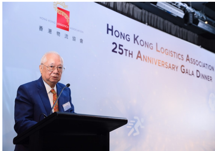
香港物流協會贊助人—胡應湘爵士 GBS, KCMG, FICE 致詞